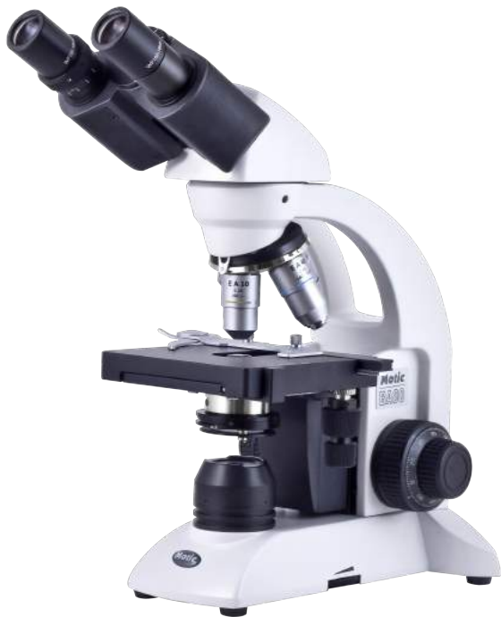
BA81A-MS | BA81B-MS

BA81A-MS & BA81B-MS comes with EA100X objective. BA81B-MS is the binocular version with the advanced Siedentopf observation tube for interpupillary adjustment between 55-75mm.