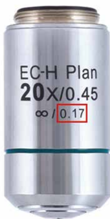
1 Infinity optics, 0.17 cover glass correction

Standard transmitted light objectives are designed for a 0.17mm cover slip between naked sample and front lens. This indication can be read on the objective sleeve (1) . Cover slips are industrial products with astonishing manufacturing tolerances (a stupendous fact in the world of optics where precise distances are essential!). The standard cover slips have a thickness of 0.13-0.16mm, taking the add-on layer of embedding medium or water into account to follow the 0.17mm rule (2) .